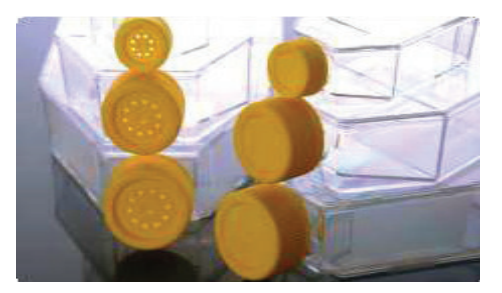
Yellow caps for non-treated flasks